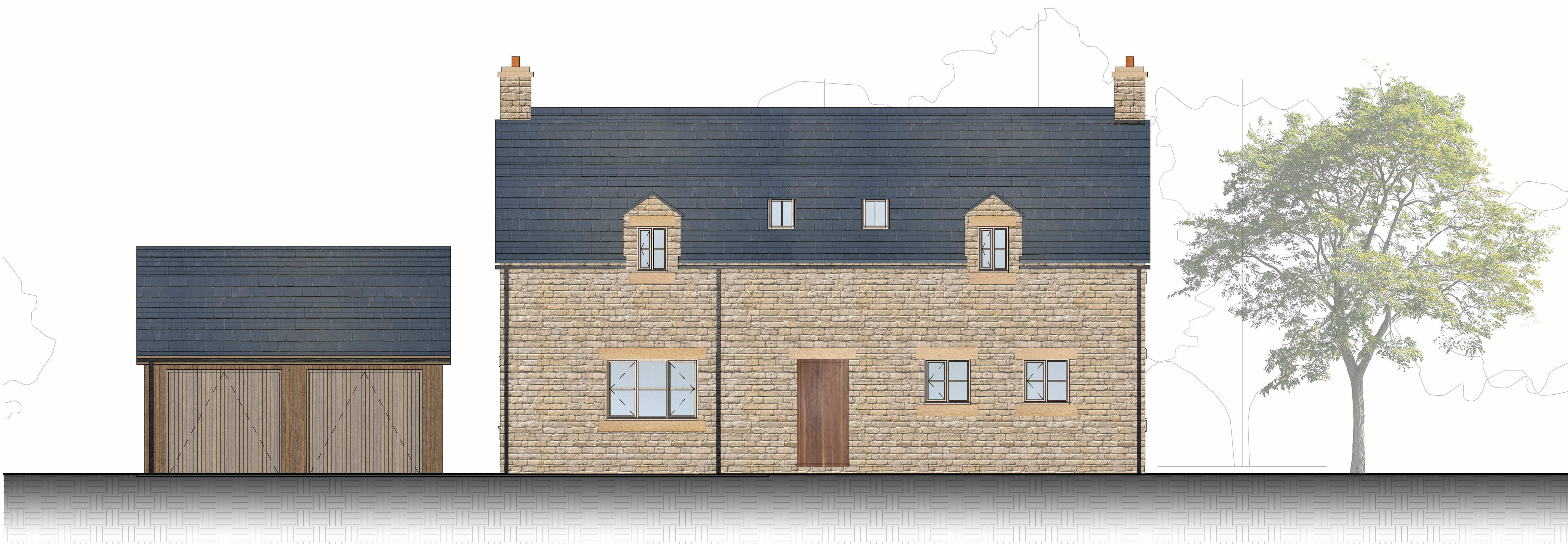
2 Front Elevation Colour Rendered 1 : 50