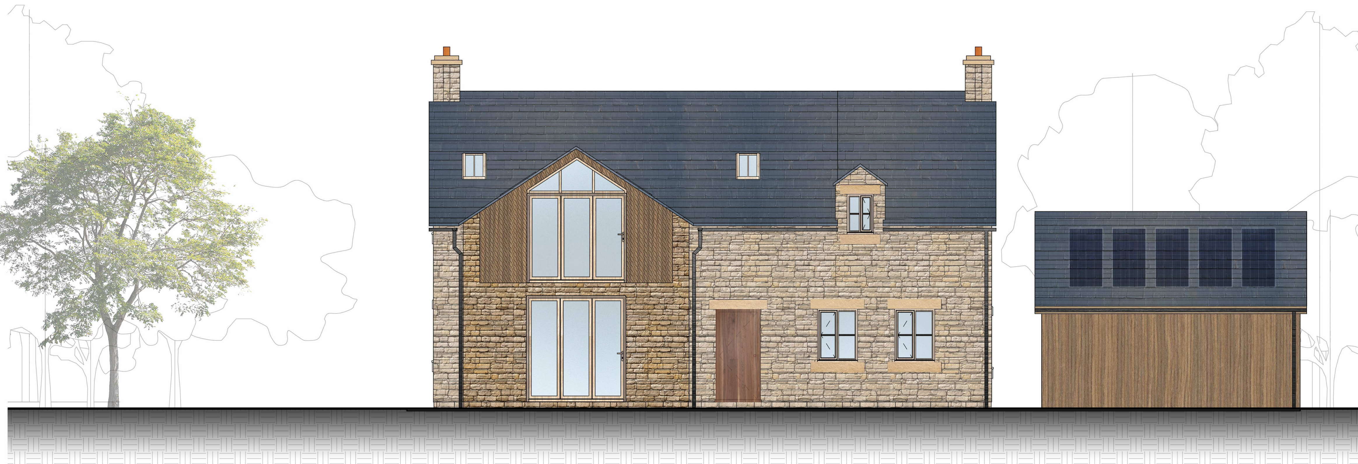
1 Rear Elevation Colour Rendered 1 : 50

NOTES: Architectural Information - the level of detail shown on the drawings is relative to the PLANNING APPLICATION . The drawings should not be used for any other purpose without the prior agreement of the Architect, and subsequent checking/ development by others. Dimensions and setting out should be checked on site. Structure & Construction - these drawings, unless expressly noted otherwise, have not been fully coordinated with a structural Engineers input and show indicative construction build up only. Building Control - the client/ the contractor will liaise directly with local authority to ensure the project is complete in accordance with the building regulations. Planning - the client/ the contractor will ensure that the project is complete in accordance with the approved planning drawings and take responsibility for the discharge of any planning conditions.