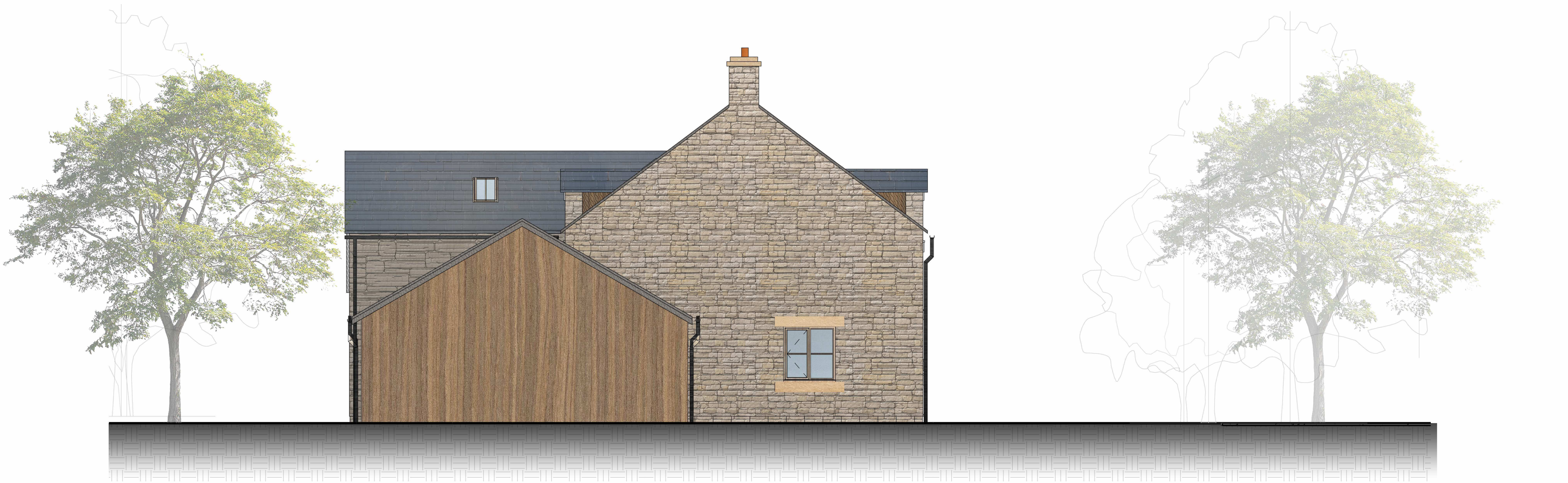
2 Vis North Elevation 1 : 50