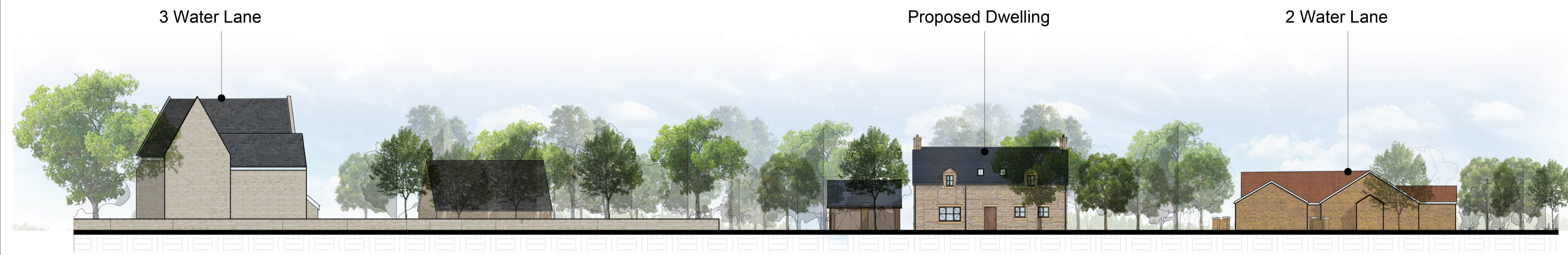
1 West Elevation Street Scene 1 : 200

Existing Area: 148m 2 Proposed Area: 148m 2